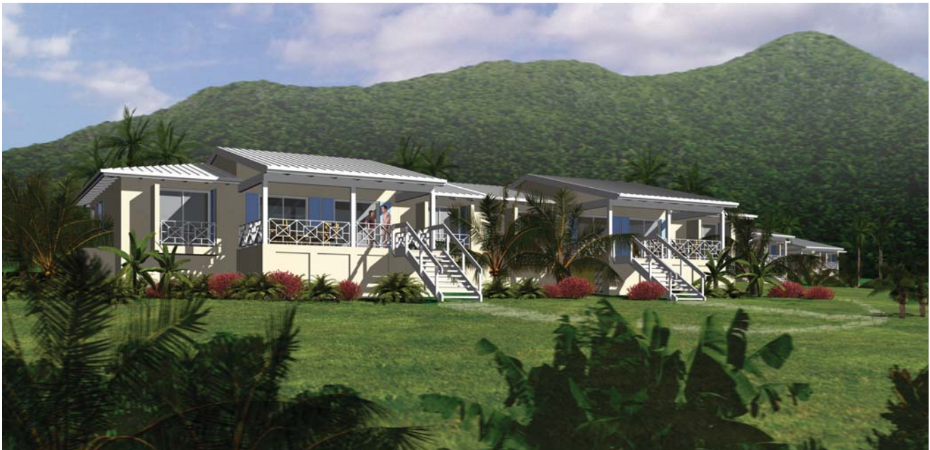
Mount Nevis Duplex Villa Rendering