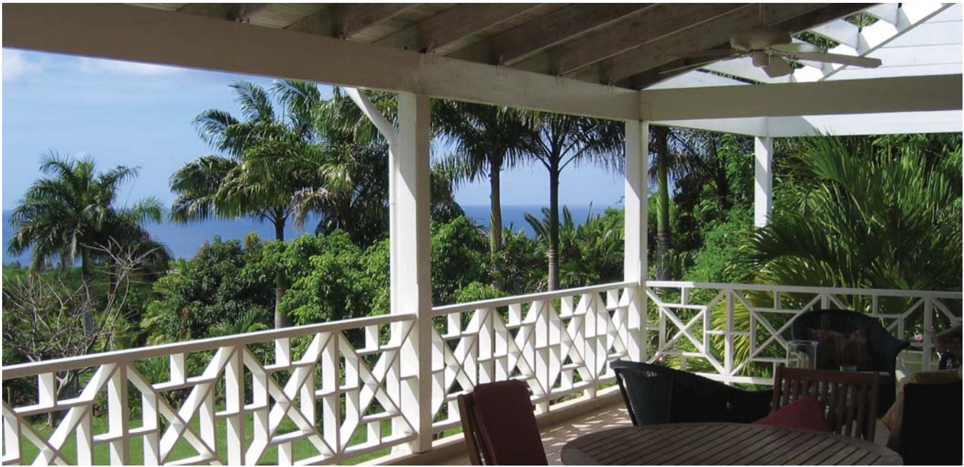
View from Veranda