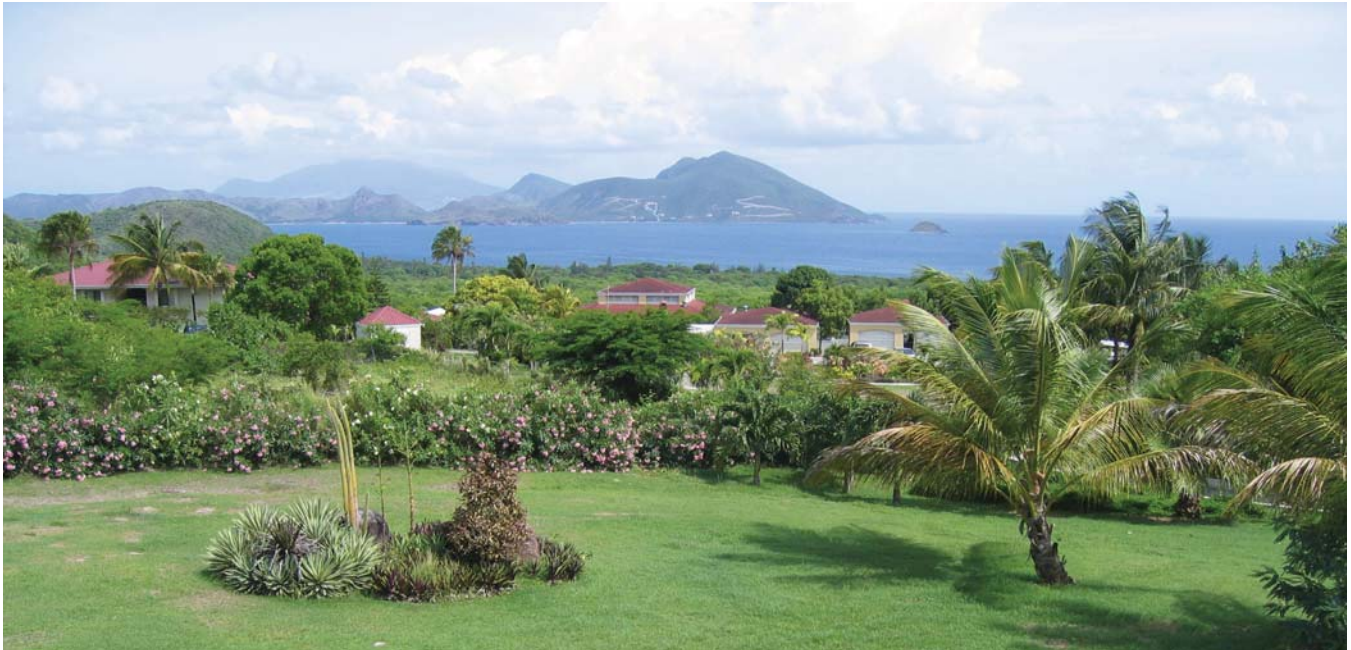
View from site towards West

Cradled by high green hills and the cloud-topped Mountain, Mount Nevis Estate, founded in 1989, has a sensational setting and spectacular views of Nevis, the Caribbean and nearby St. Kitts. The resort is now expanding beyond the original 16 apartment units and 5 villas, by adding 22 duplex villas on the gently sloping 17 acres site.